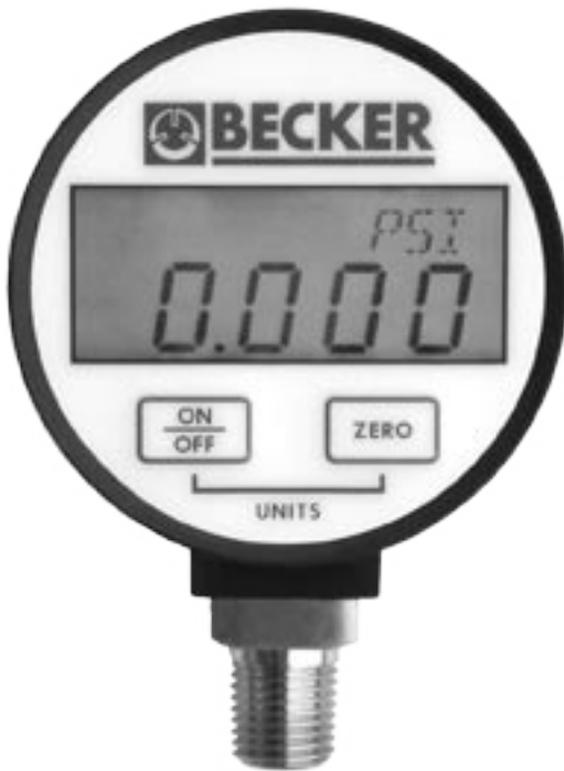
Actual Size (DPG05 shown)

Manufacturer reserves right to alter data without notice.